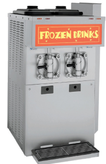
Shown with optional top air discharge chute.