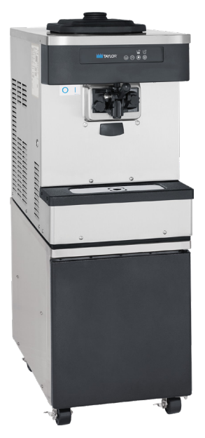
Taylor C152 with optional C208 cart