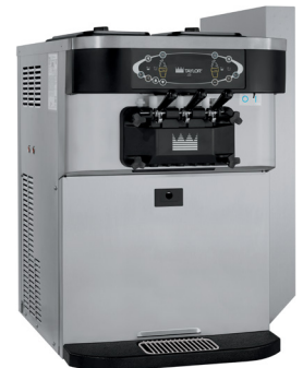
Shown with optional top air discharge chute.

Shown with air discharge chute optional C206 cart.