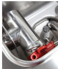
Simplified air/mix pump