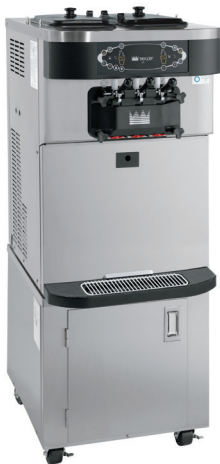
Taylor C722 with optional C206 cart