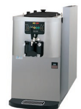
Shown with top air discharge chute.

*Minimum air clearances MUST be met to assure adequate airflow for optimum performance of air cooled machines. Place the back of the unit against a wall to prevent recirculation of warm air. Failure to allow adequate airflow will invalidate any warranty claim.