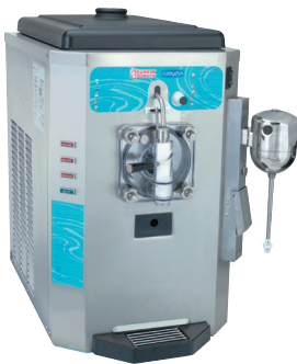
Taylor 430 with optional spinner