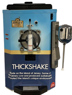
Taylor 430 with optional branding